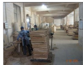
Photo of the inside of the main production hall Woodworking section.JPG