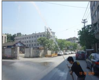
Photo of fire safety equipment Fire hydrant testing.JPG