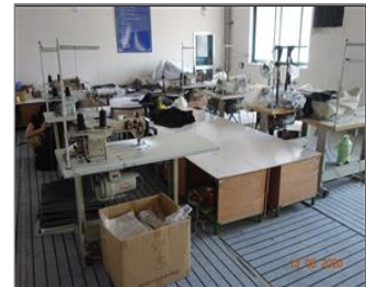
Photo of the inside of the main production hall Sewing section.JPG