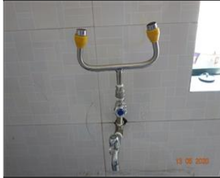
Photo first aid facilities Eye wash system.JPG