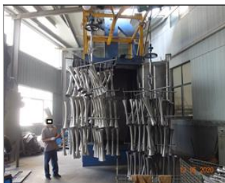
Photo of non-conformity NC 7.17 no antikid hook installed for one travelling crane at the blasting section.JPG