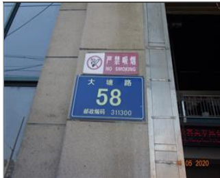
External photo(s) of the production unit(s) Factory address.JPG