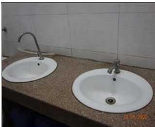
Photo of non-conformity NC 7.22 no basic supplies such as toilet paper or soap available in the toilets.JPG