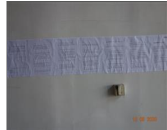
Photo of the code of conduct on display amfori BSCI COC posted in public.JPG