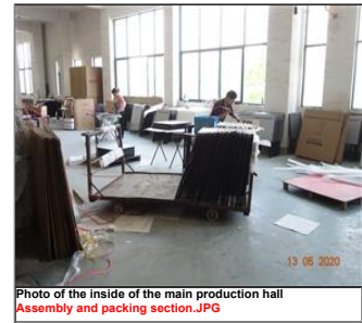
Photo of the inside of the main production hall Assembly and packing section.JPG