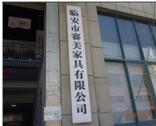
External photo(s) of the production unit(s) Factory name.JPG