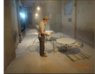
Photo of the inside of the main production hall Painting section.JPG