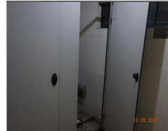
Photo of the sanitary facilities Toilets.JPG