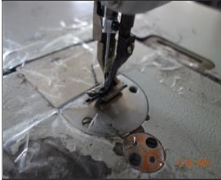
Photo of non-conformity NC 7.17 no eyeshield for the sewing machine.JPG