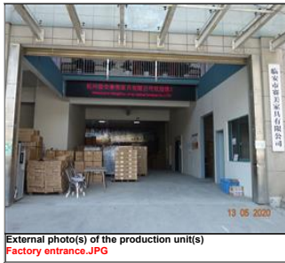
External photo(s) of the production unit(s) Factory entrance.JPG