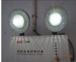
Photo of fire safety equipment Emergency light testing.JPG