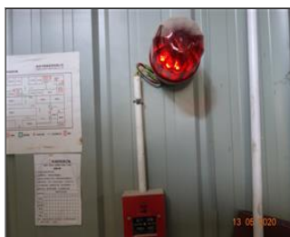
Photo of fire safety equipment Fire alarm.JPG