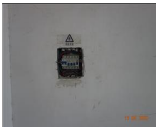
Photo of non-conformity NC 7.13 the electrical box not equipped with covers.JPG