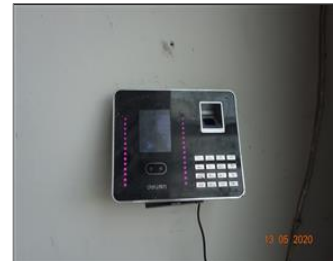
Photo of the inside of the main production hall Attendance machine.JPG