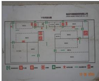
Photo of fire safety equipment Emergency plan.JPG