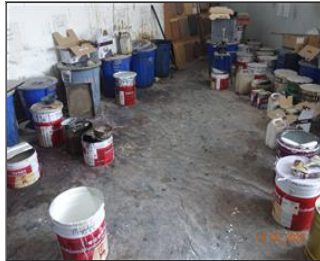
Photo of non-conformity NC 7.7 No label for the paint stored in the chemical warehouse.JPG