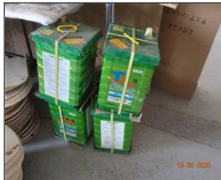
Photo of non-conformity NC 7.7 the glue stored in the production area without 2nd container.JPG