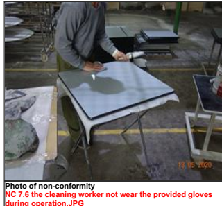
Photo of non-conformity NC 7.8 the cleaning worker not wear the provided gloves during operation.JPG