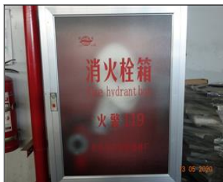
Photo of fire safety equipment Fire hydrant.JPG