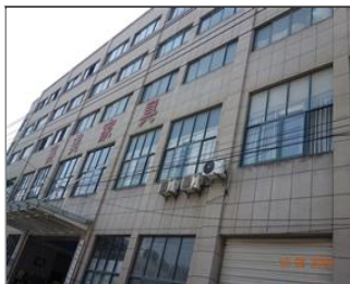
External photo(s) of the production unit(s) Production buildings.JPG