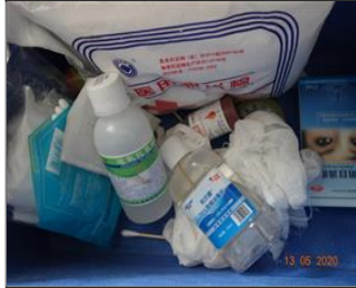
Photo first aid facilities First aid kit.JPG