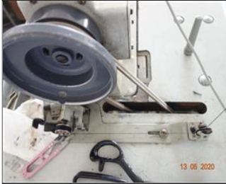
Photo of non-conformity NC 7.17 no pulley safety guards for the sewing machine.JPG