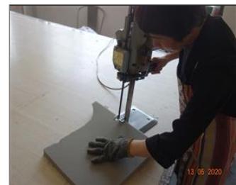
Photo of the personal protection equipments (if applicable) The worker wear ppe during operation.JPG