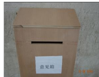
Photo of the inside of the main production hall Suggestion box.JPG