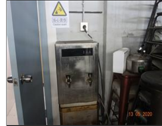
Photo of the sanitary facilities Drinking area.JPG