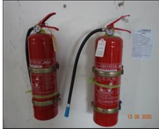
Photo of fire safety equipment Fire extinguishers.JPG