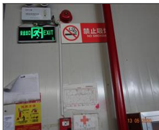
Photo of fire safety equipment Exit sign and emergency light.JPG