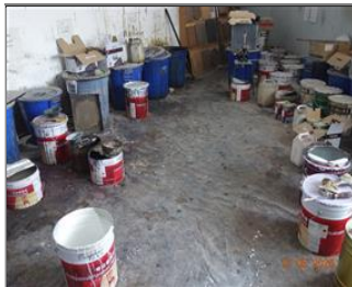
Photo of chemical storage room (if applicable) Chemical section.JPG