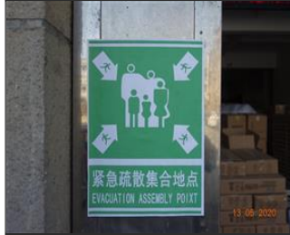
Photo of fire safety equipment Assembly point.JPG