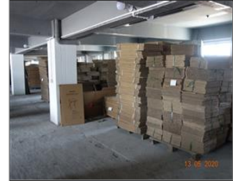
Photo of the inside of the main production hall Raw material section.JPG